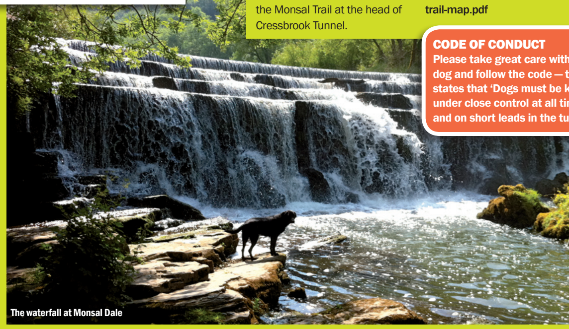
The waterfall at Monsal Dale